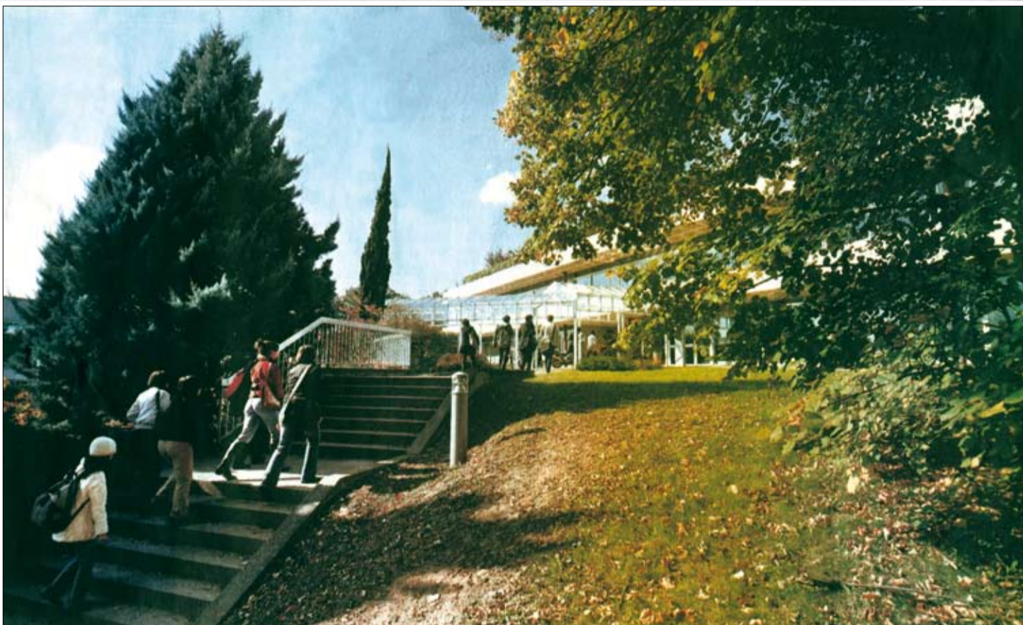
Students at EM Lyon: French schools dominate the FT rankings for post graduate masters in management degrees

"It turns out the brand and the network of the